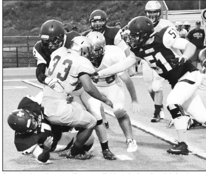
Sporting brand new uniforms on Friday, the Panthers' defensive front resembled the Minnesota Vikings' legendary "Purple People Eaters" defense in both attire and physicality.